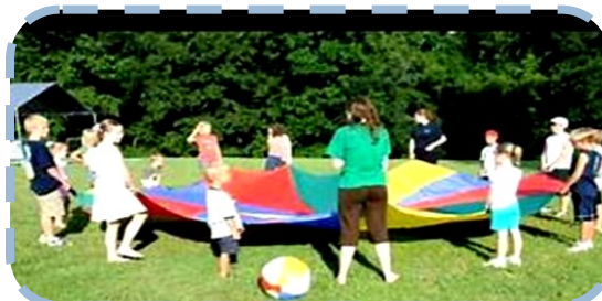
Children playing ball with the parachute!