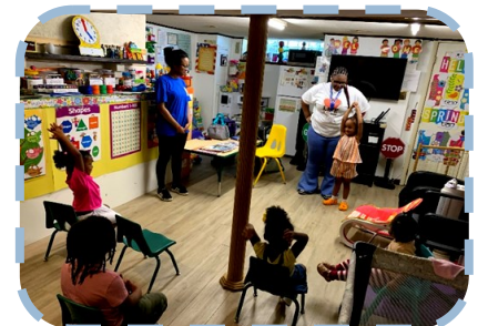
Children interacting with the Bible teacher!